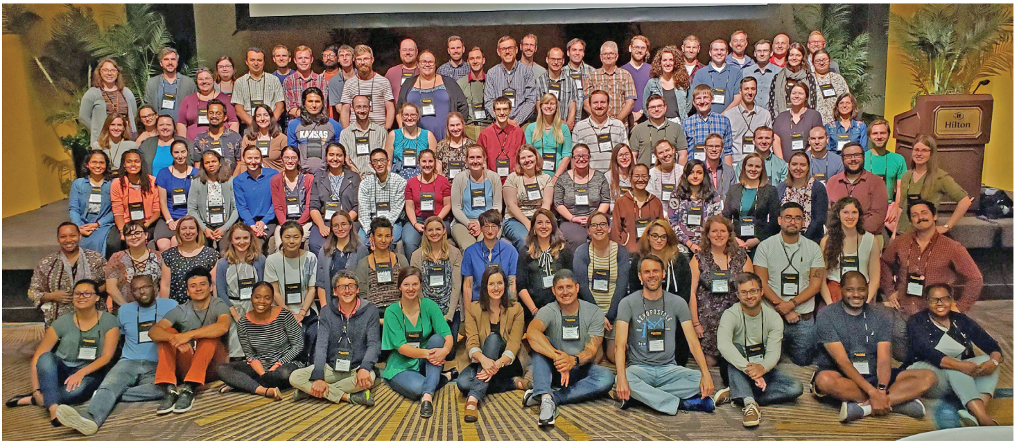
MAA Project NExT SILVER'19 Cohort at MAA MathFest in 2019.