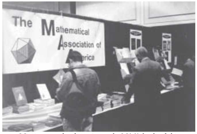
Meeting attendees browsing at the MAA's book exhibit.

As happens every year, this January the American Mathematical Society and the MAA held joint national meetings. This year's joint meetings brought almost 5,000 mathematicians, mathematics educators, and other interested folk to New Orleans. Lectures, special sessions, employment interviews, business and committee meetings filled the days, and no one's experience was quite like someone elses's. The several articles that follow make up a composite report on the meeting and the many events that surrounded it.