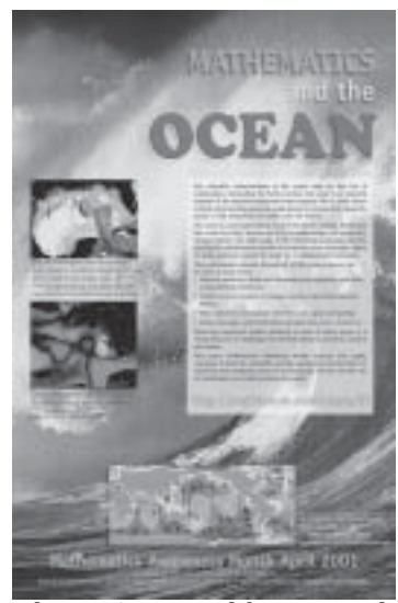
This year's poster celebrating Math Awareness Month.

mote from coastlines, by driving the Earth's climate in partnership with atmospheric dynamics. Oceans give us food and other goods; we use them for transportation and recreation; and for millen-