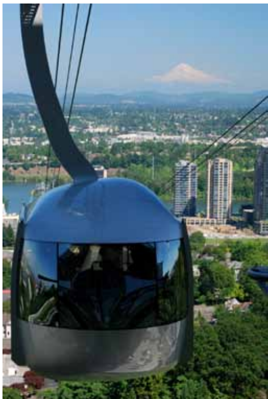
Portland Tram.

It is often difficult for students to develop an accurate and intuitive understanding of the geometric relationships of calculus from static diagrams alone. This course will explore a collection of freely available Java applets designed to help students make these connections. Our primary focus will be on visualizing multivariable calculus using CalcPlot3D, a versatile new applet developed by the presenter through NSF-DUE-0736968. Participants will learn how to customize this applet to create demonstrations and guided exploration activities for student use. Images created in this applet can also be pasted into participant's documents. See http://web.monroecc.edu/calcNSF/ . Some basic HTML experience is helpful.