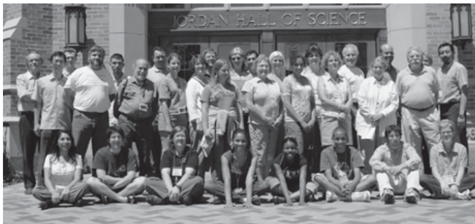
The participants in last year's Institute.

People can learn this approach, as our Math Circle Summer Teacher Training Institute last July at Notre Dame showed. We will hold the Institute again this summer. Last year 24 people came from across the country, as well as from Mexico, Singapore, and Argentina. They ranged from elementary school teachers to university professors, and the mix was wonderful. After playing the role of students