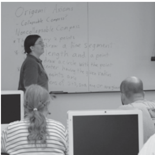
Working out the axioms for origami.

a vibrant and diverse cohort has formed simply for the love of math. There has also been an intrinsic motivation for the cohort to establish a way to persist.” There was talk of starting a Wiki to allow continued collaboration.