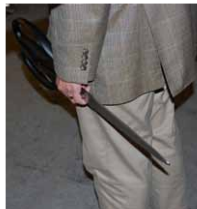
Ready to cut. (RM)