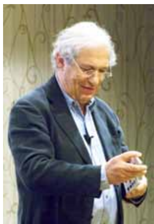
Persi Diaconis demonstrates perfect shuffles. (FG)