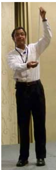
Ravi Vakil explains the moduli space of lines in \mathbf{R}^3 . (FG)