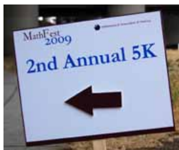
For those who think running 5 kilometers is fun... (RM)