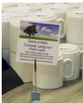
Sustainable coffee drinking. (FG)