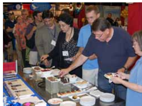
Ice cream at Casio.