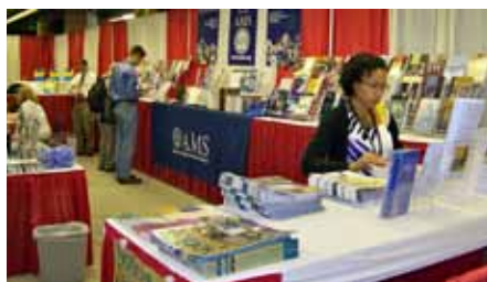
AMS Booth. (FG)