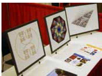
Mathematical Art exhibit. (RM)