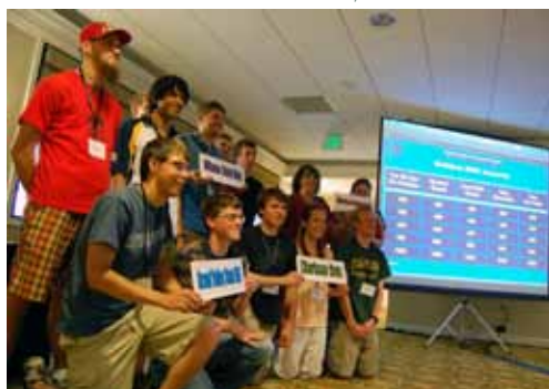
Math Jeopardy teams.